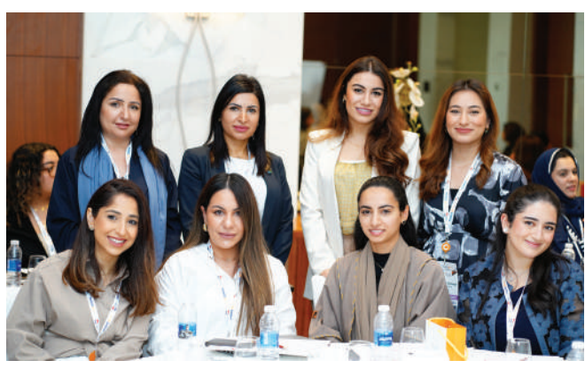
LEWAS Workshop participants.