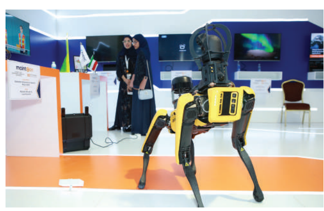
The Substation Autonomous Inspection Robot (SAIR), which became one of the main attractions in the Exhibition Area.