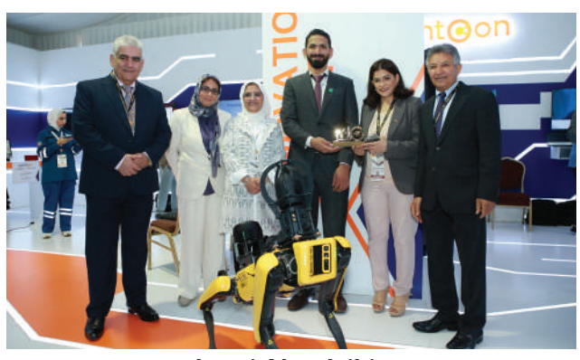
Louai Alqudaihi Substation Autonomous Inspection Robot (SAIR), Saudi Aramco