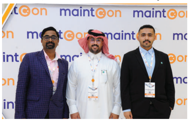
Delegates from Saudi Aramco